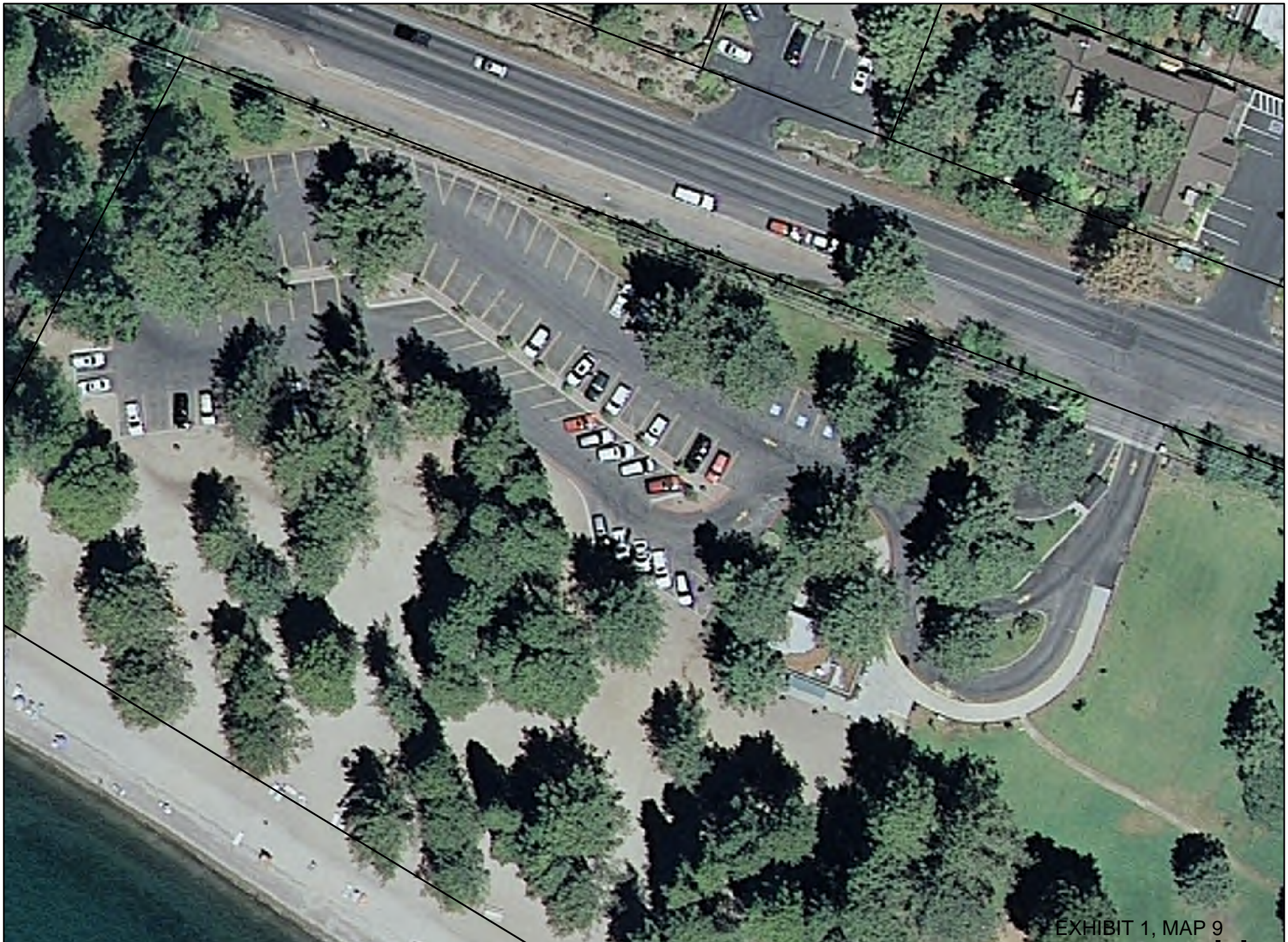
EXHIBIT 1, MAP 9