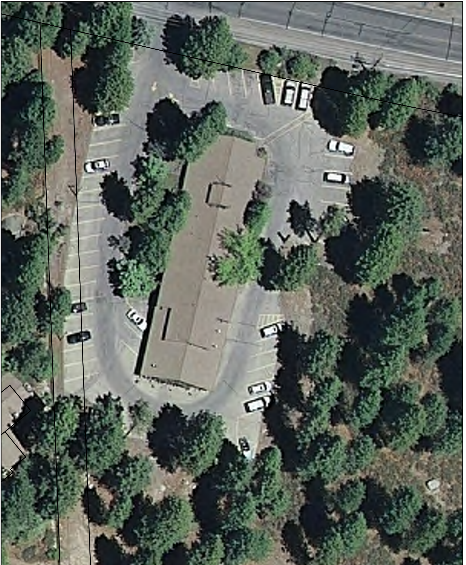
ANNE VORDERBRUGEN BUILDING IVGID ADMINISTRATION 893 SOUTHWOOD BLVD.