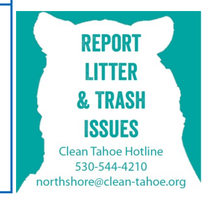
Visit BEARSMARTINCLINEVILLAGE.ORG for tools for co-existence with the wildlife.